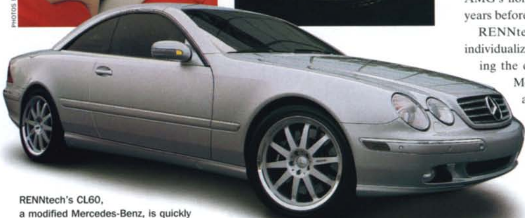
RENNtech's CL60, a modified Mercedes-Benz, is quickly becoming a favorite among car enthusiasts.