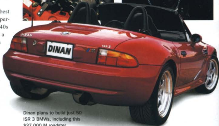
Dinan plans to build just 50 ISR 3 BMWs, including this $37,000 M roadster.