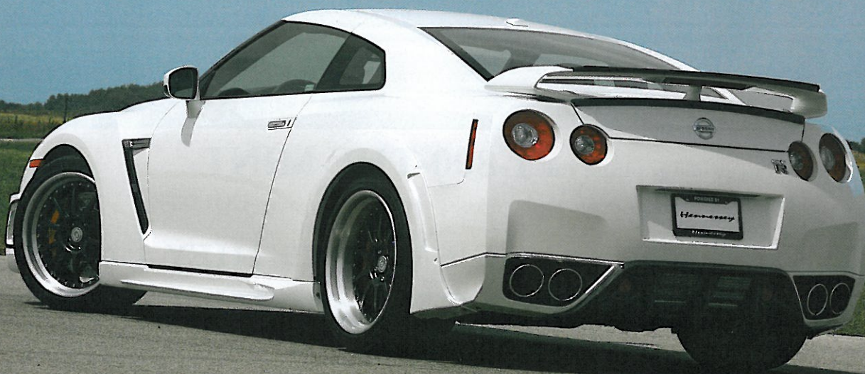
TOP: DAN STEINHAUSER